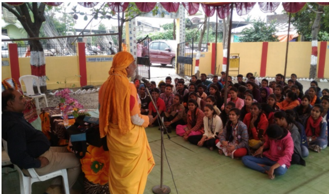
NSS Shibir at Dhargaon